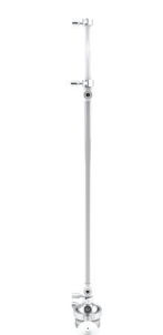
XCell ATF 2 SS