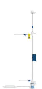
XCell ATF 1 SU

XCell ATF Lab Devices scale linearly from intensification development to manufacturing. Available in Single-use (SU) and Stainless-Steel (SS) formats, working volumes range from 0.5 L - 50 L. The XCell ATF 1 Device provides the smallest working volume and features integrated accessories, including an AseptiQuik® Connector and a permeate pressure sensor. The 0.5 - 2 L XCell ATF 1 working volume reduces media costs and provides linear flux and shear parameters for scale-up to 5000 L.