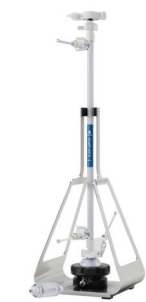
XCell ATF 2 SU