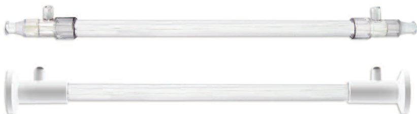
Figure 2. MidiKros® & MidiKros® TC module.